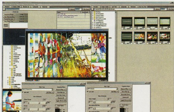
● The Sequencemaster 2 workflow in all its glory. A dual view - with one as thumbnails - a preview window and a playable preview of a custom chromakeyed sequence. What more could you want?

Add to this directory bookmarking, colour-coded network directories, a two-view window and all the other stuff it offers, and you soon realise that Sequencemaster 2 really is an amazingly good piece of software. Its TARDIS-esque toolset coupled with its modest price tag makes it useful for every stage of a project. In terms of competitors, it really only has one: an admittedly more powerful, but much more expensive, application. All we can say is: Alienbrain , look to your laurels: Sequencemaster 2 may yet manage to knock you off your perch. ●