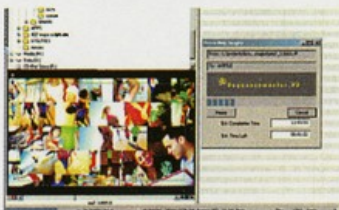
● Sequencemaster 2's Pro Player is a fantastic feature. Here it is, converting an IFF sequence to an AVI with just a single button press

all of the frames you have rendered in one long series, each displaying its file size. This means that if you think you missed a frame, but you can't be sure, you can actually check to see if there's a failure trough in the graph. Swiping over the trough, you can render the selected sequence again - at least, if you're a Maya user, this being one of the few features of Sequencemaster 2 that is tied in to a specific 3D package: the standard